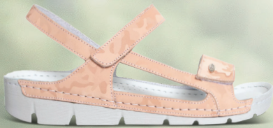
MIRI PINK CAMOUFLAGE