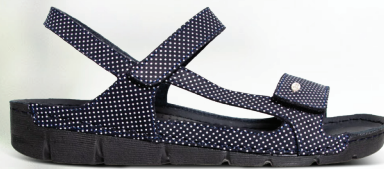
MIRI BLUE SPOTTED