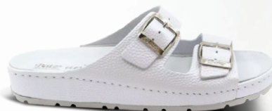
ZITA PEARL WHITE