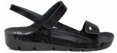
MIRI CAMOUFLAGE BLACK