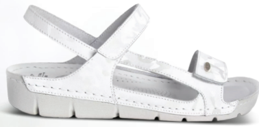
MIRI CAMOUFLAGE WHITE